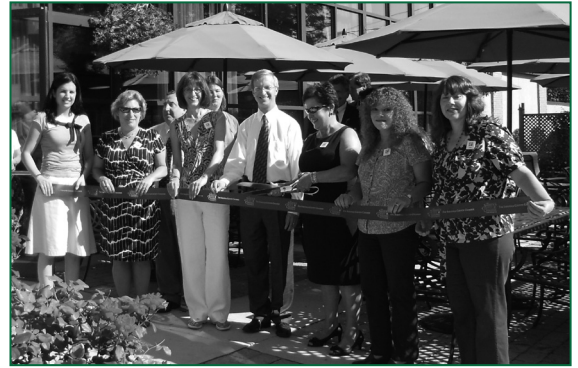
Ribbon cutting at the Holiday Inn in 2011 for the opening of their new patio.